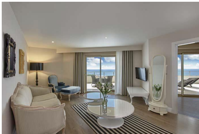
Suite Living room

Suite: in total 2 bedrooms, 58 m 2 , 1 bedroom (1 double bed), 1 living room, 1 shower / WC and terrace (Jacuzzi is located on the terrace). The features are air conditioning (central, between certain hours), hair dryer, direct telephone, LCD TV (satellite), music receiving, safe, mini bar, Laminate, kettle, tea and coffee. Every day housekeeping, towels are changed every day, and sheets are changed once every two days. View of the room: Sea Side View. (Accommodation type max: 2 adults).