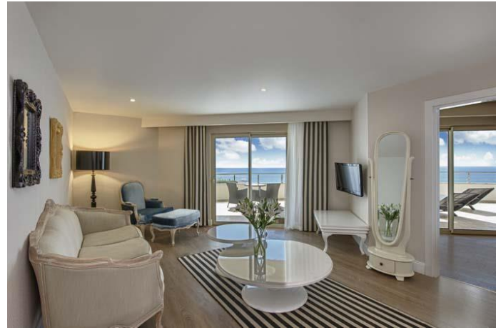
Suite Living room

Suite: in total 2 bedrooms, 58 m 2 , 1 bedroom (1 double bed), 1 living room, 1 shower / WC and terrace (Jacuzzi is located on the terrace). The features are air conditioning (central, between certain hours), hair dryer, direct telephone, LCD TV (satellite), music receiving, safe, mini bar, Laminate, kettle, tea and coffee. Every day housekeeping, towels are changed every day, and sheets are changed once every two days. View of the room: Sea Side View. (Accommodation type max: 2 adults).