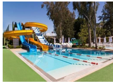
Aqua Pool 2