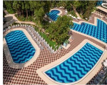
Pool 3 (top left), 4 (middle), 5 (top right)