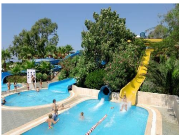
Aqua Pool 1