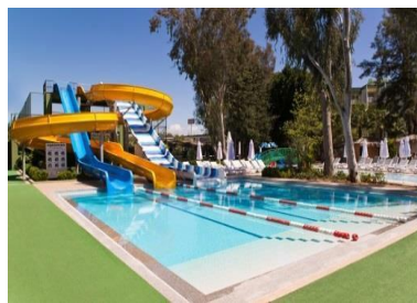
Aqua Pool 2