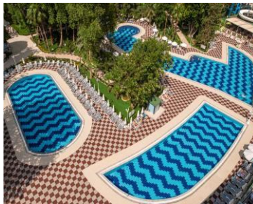
Pool3(top left), 4(middle), 5(top right)